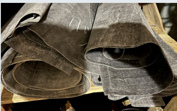
Paronite (Paronite coating)