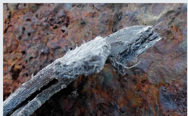
Paronite gasket (broken)